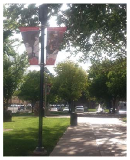
Hodgin Hall courtyard area.